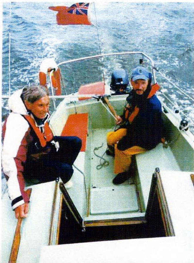
▲ The outboard fits in the transom well and hinges up under sail – here we're motor-sailing

out the engine itself and took off the prop, leaving the shaft in place. Economy of removal being a priority, he left the exhaust outlet in the transom too, simply cutting off and bunging up the pipe on the inside.