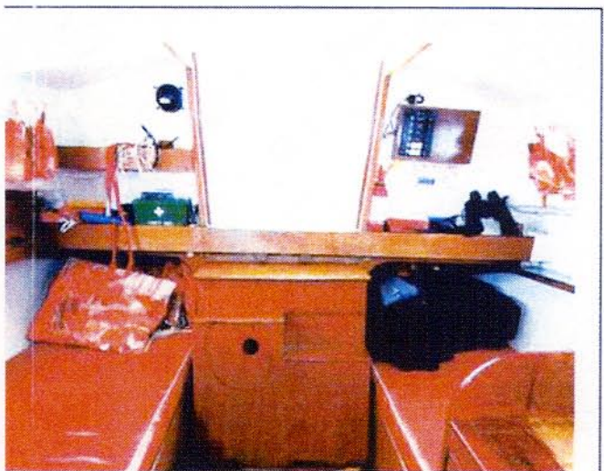
ABOVE Now that the original Stuart Turner 5hp petrol inboard has been removed, the space behind the companionway steps is used for stowage

You will pay more for a Leisure than for the Kingfisher or Pandora because she's both newer and roomier. She's also an appreciably better performer for her size than the rather pedestrian Leisure 22 and the slightly sharper 23.